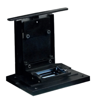
35 mm film strips